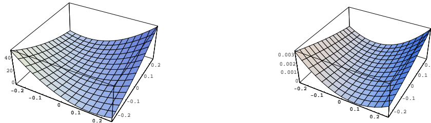
Figure 2: The controllability (left) and observability (right) functions for Example 5.2

respectively. Examining these functions near the origin (see Figure 2) it is evident that they are strictly