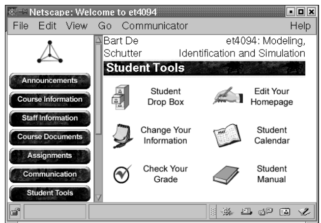
Figure 2: The Blackboard CourseInfo student tools page contains several communication and information tools for the students.

for our course. Figure 2 shows a screenshot of some of the students tools that are available in Blackboard CourseInfo.